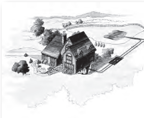
Even Systems for your Pond!