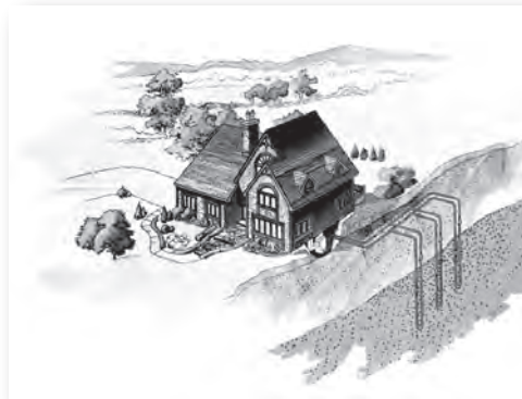
We design Vertical Systems